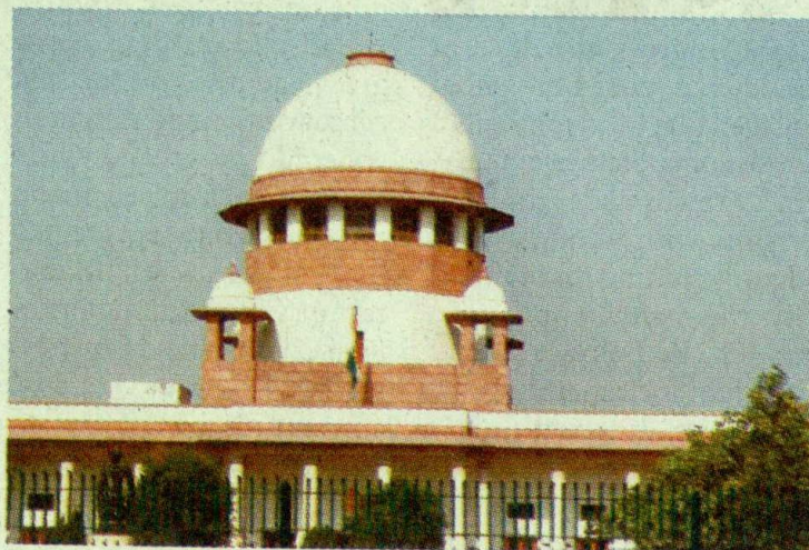
Supreme Court of India

Apex court said as per provisions of AICTE and University Grants Commission Act, council has no authority which empowers it to issue or enforce any sanctions on colleges affiliated with the universities as its role is to provide guidance and recommendations.